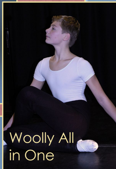
Woolly All in One