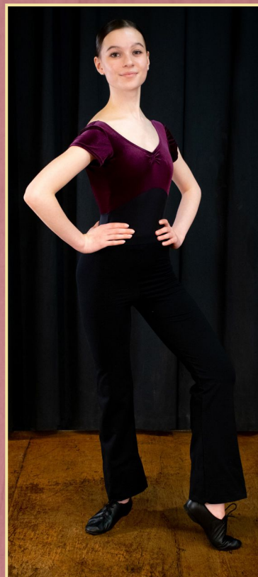
Seniors - Velvet Leotard & Jazz Pants