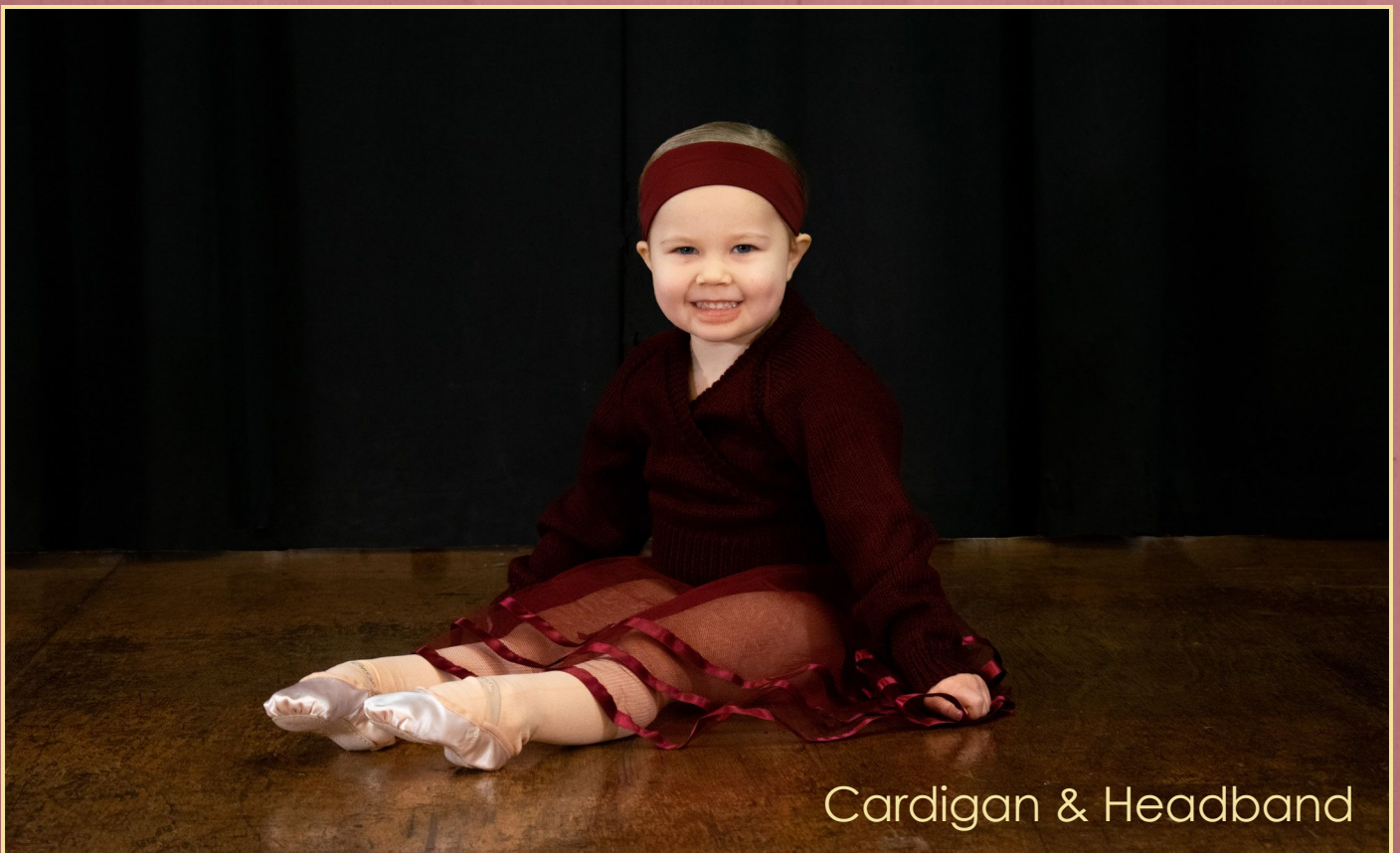
Cardigan & Headband