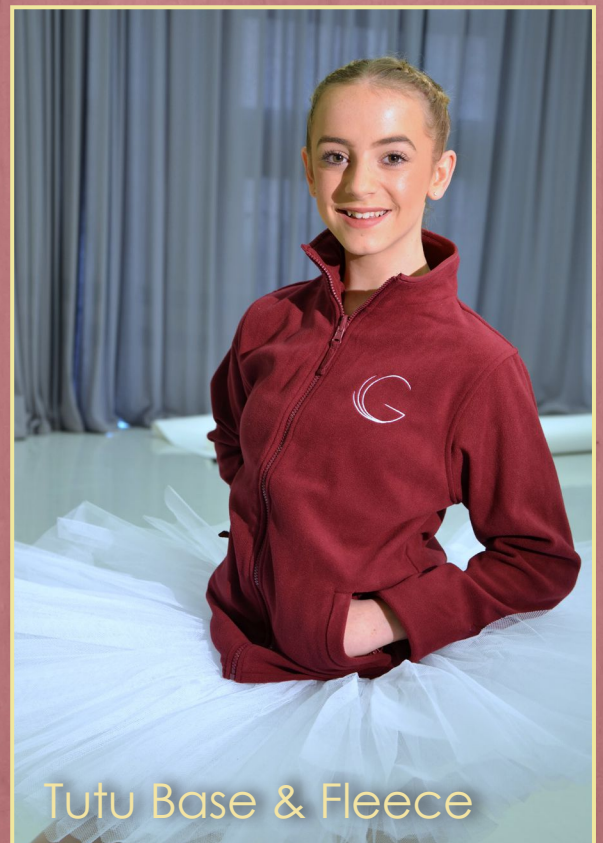
Tutu Base & Fleece