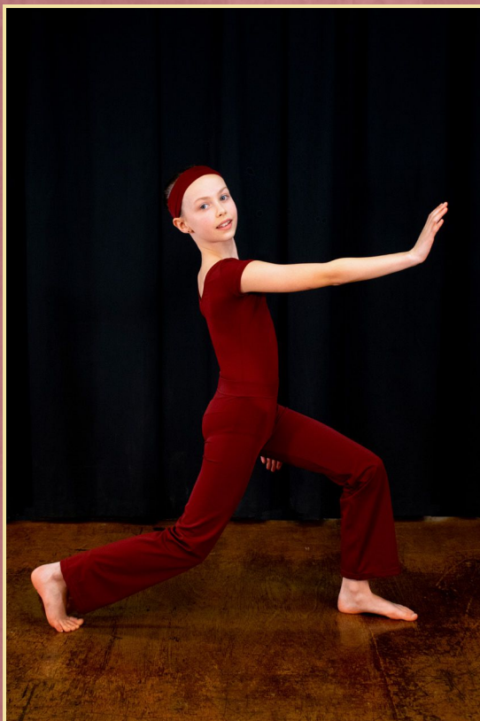
Juniors - Cap Sleeved Leotard & Jazz Pants