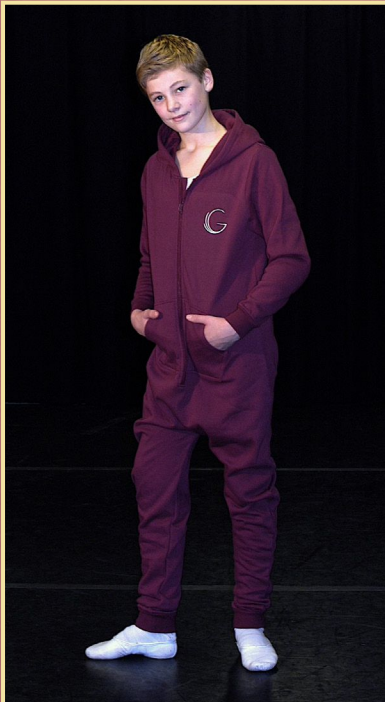
Pink Onesie (First Steps to Grade 2)