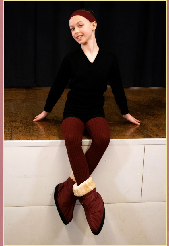
Burgundy Fur Topped Boots - Two Sizes Available